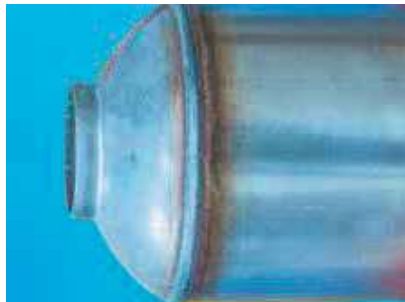
Exhaust system in ferritic stainless steel