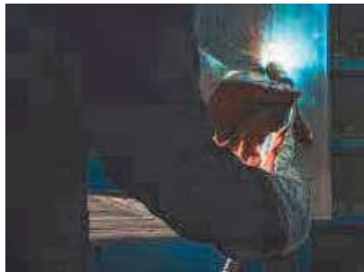
All position welding