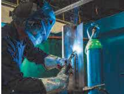
MAG welding of stainless steel

The high-performance gas shielding solution for all stainless steel MAG applications